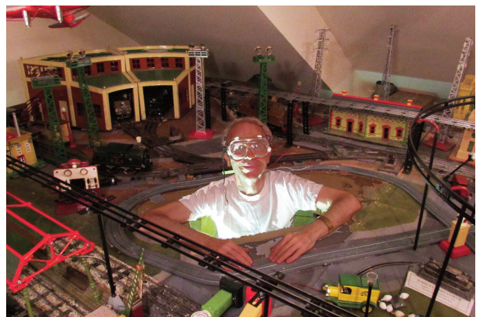
Worn from hours of inspecting very extensive underground wiring, the BRR president emerges back into the world.