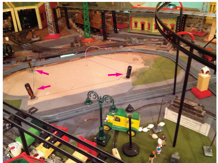
After the great Bessley City Station was moved, the excavation team planned the new access hole. The screw driver handles mark the area where rewiring was required before the large excavation.

The O27 trolley track is supported by 4" crossbars from Texas Lamp Parts. See photograph on next page. Threaded lamp pipe screws into the crossbar. At the bottom the pipe is supported by wood simulated concrete bases which supply some support. The pipes are securely fastened by washers and nuts.